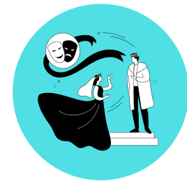
My Acting School Hobart, TAS